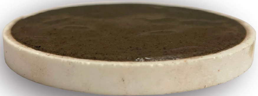
Filter cake formed after treating with 6 lb/bbl WALLPLEX

WALLPLEX is a wall cake additive designed to reduce fluid loss and enhance overall lubricity.